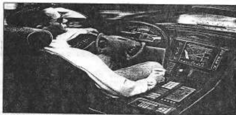
SHARP ELECTRONICS' NEW LINE OF ACTIVE MATRIX FLAT-PANEL DISPLAYS are ideal for automotive and other transportation applications. These full-color, NTSC- and PAL-compatible, 4"-diagonal to 5.6"-diagonal LCDs are suitable for displaying transportation information such as global positioning and diagnostic screens. Four models are available ranging from $400 to $999. For more information, contact Sharp Electronics Corporation, 5700 N.W. Pacific Rim Blvd., M.S. 100, Beaverton, WA 98007. (800) 541-0241.